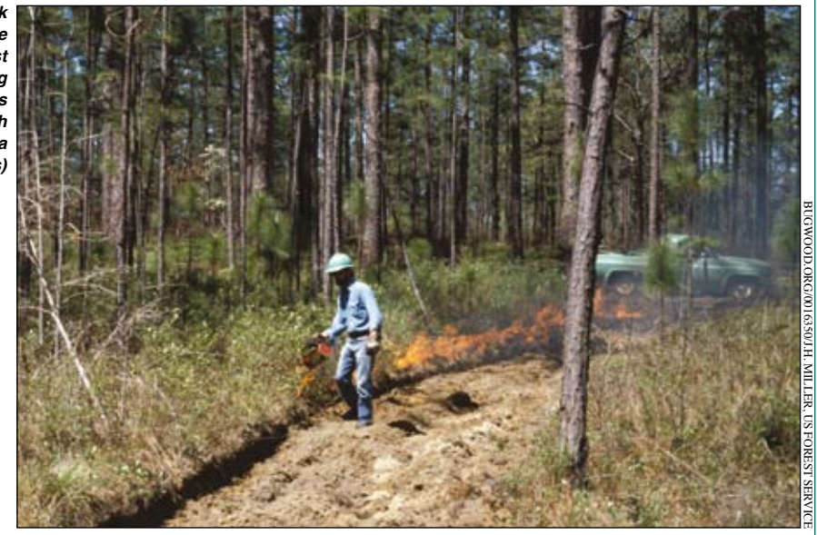
Fuel management work helps reduce the incidence and severity of forest wildfire, thus lessening carbon emissions (prescribed fire to establish a control line off of a firebreak, United States)

generated in developing countries where wages are relatively low.